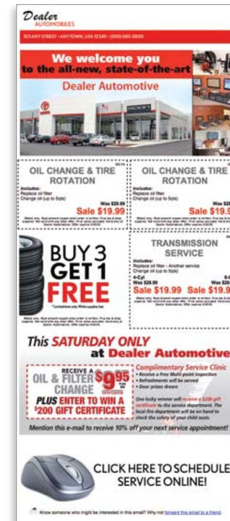
Sample image only