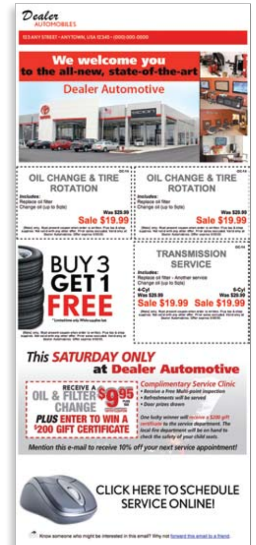
Sample image only