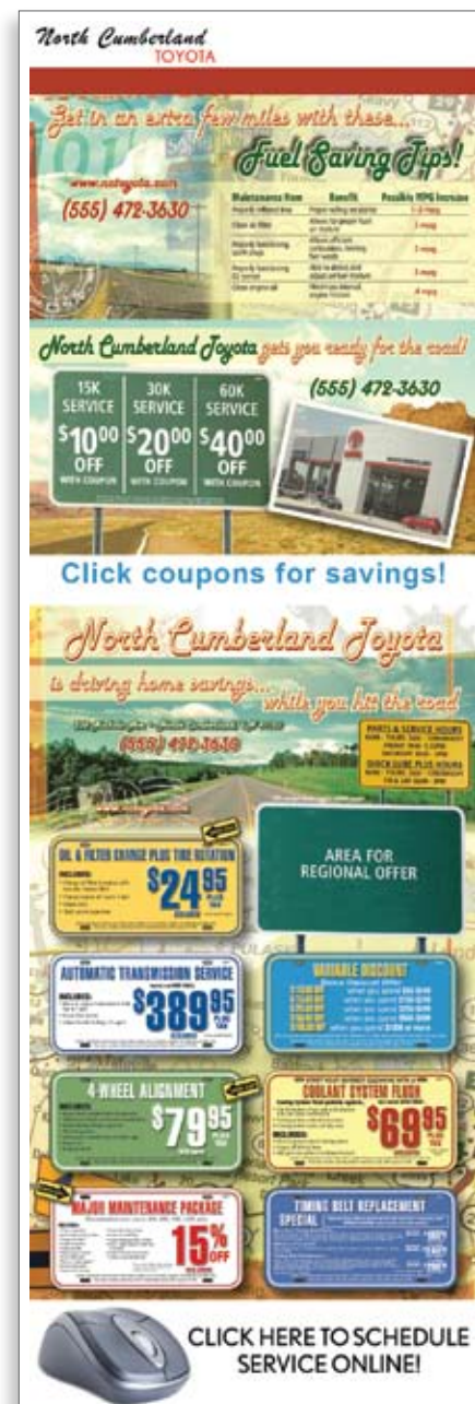
Sample image only