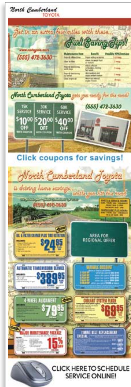
Sample image only