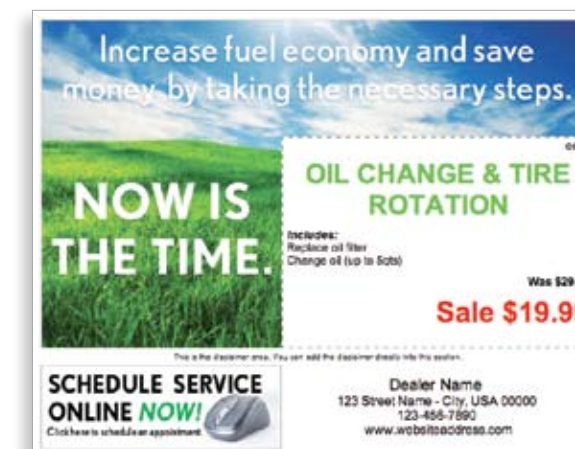
Sample image only