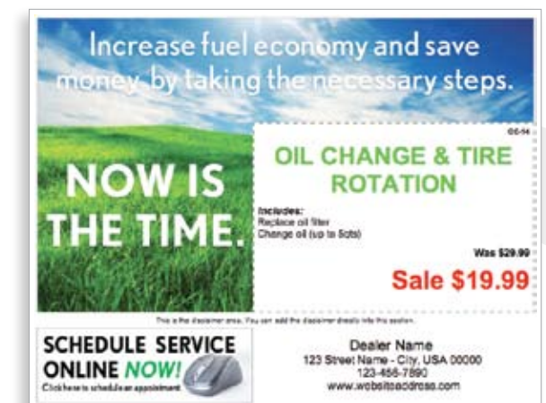
Sample image only